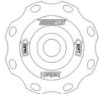
Figure 2 Top View of Cap showing Hard, Soft adjustments