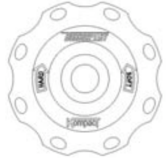
Figure 2 Top View of Cap showing Hard, Soft adjustments