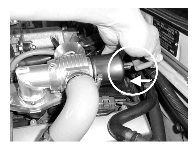
Step 11. Your installation is complete and should look the same as the picture below.

Step 10. Connect the free end of the 5mm ID Silicon hose to the Turbosmart BOV fitting. Secure the fitting with the remaining 5mm hose spring clamp supplied.